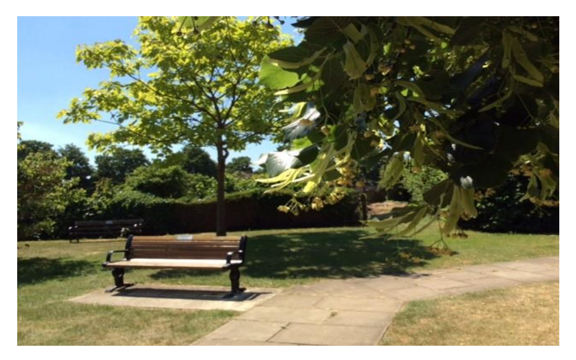
Seat with bean tree behind and lime flowers in the foreground