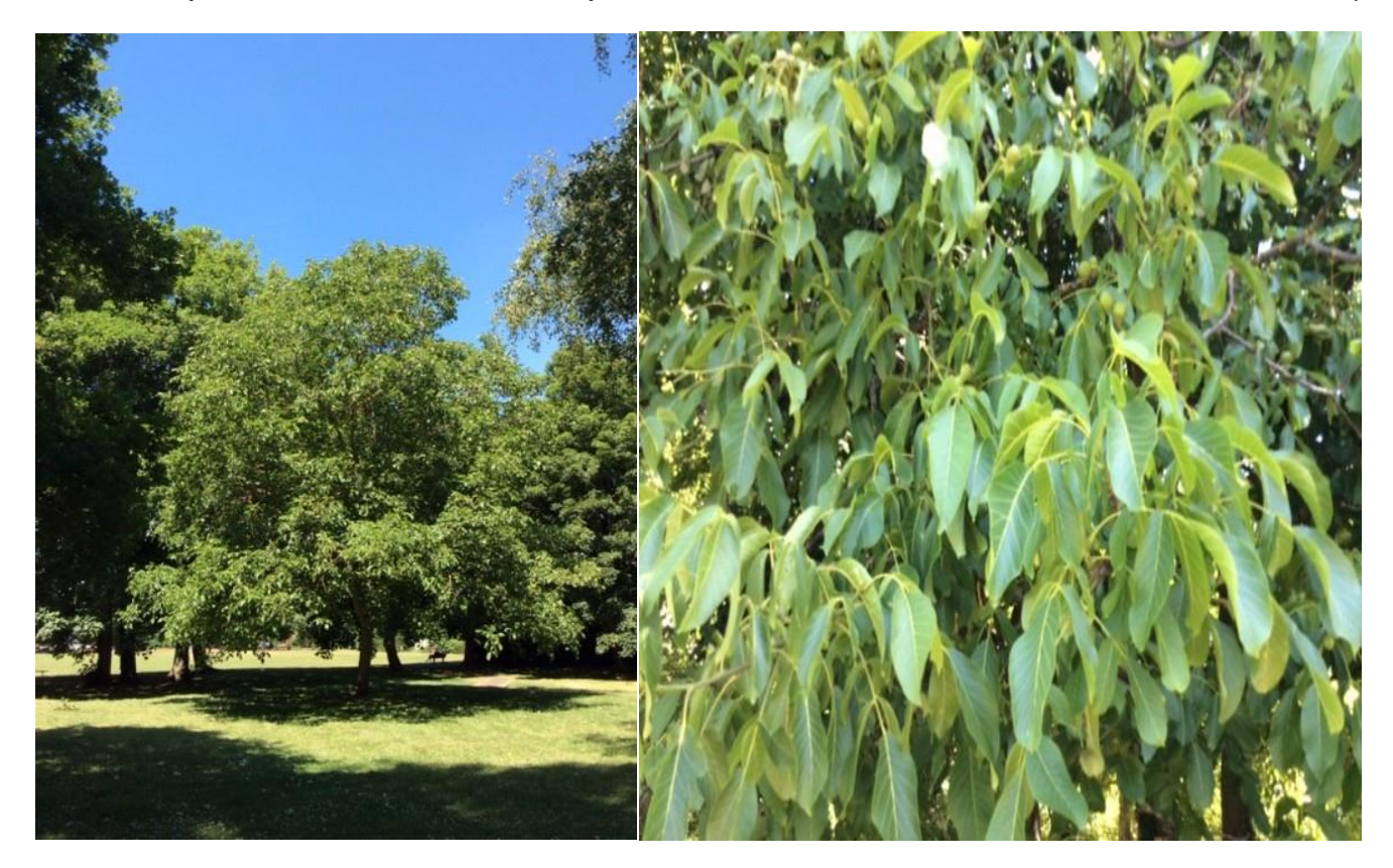
Walnut trees (number 3 on the map)

When you reach the wooded area you will find three walnut trees as identified on the map.