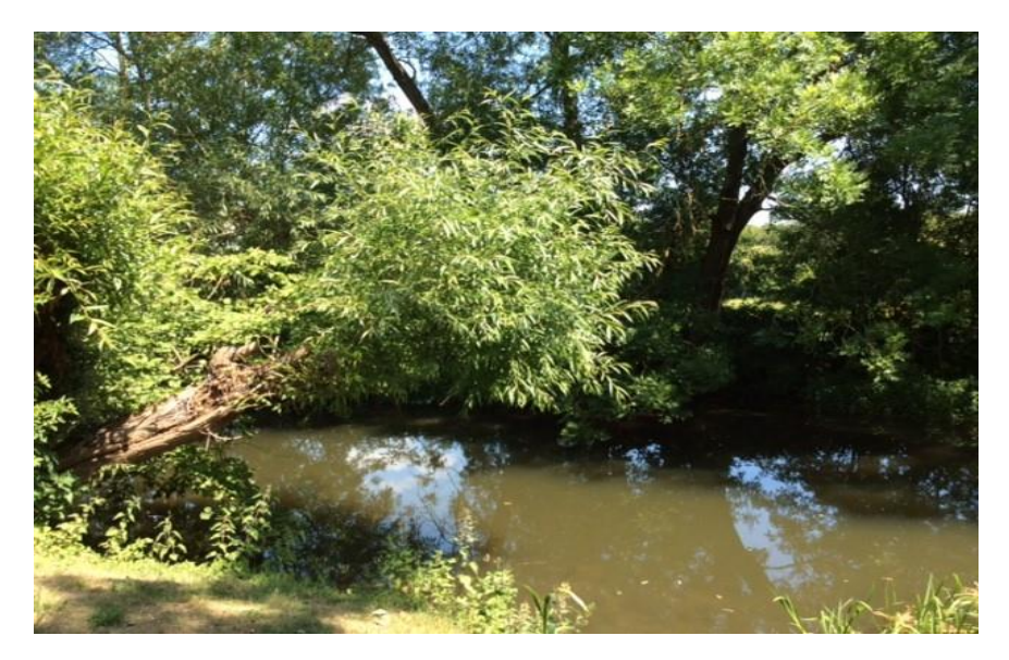
Willow over the Abbey River

Once past the redwood tree you leave the wooded area behind and you will find yourself in another open grassed area with two seats, with a view of the Abbey River, and another part of the dry moat behind you. The monks, who are said to have widened the Abbey River by hand, also built weirs on the river to help catch fish which was the staple part of their diet. Meat was only eaten on special occasions.