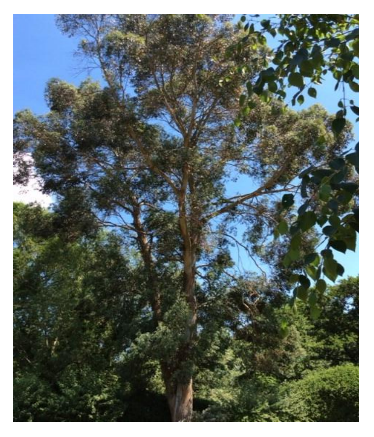
Eucalyptus Tree (number 10 on the map)

The eucalyptus tree is native to Australia where it is the staple diet of the koala bear. Eucalyptus oil is made from the leaves of the tree, which are crushed and then distilled. Sometimes a red resin exudes from the bark of the tree, which is where its other name 'gum tree' comes from. The eucalyptus is evergreen, so its leaves are green all year round.