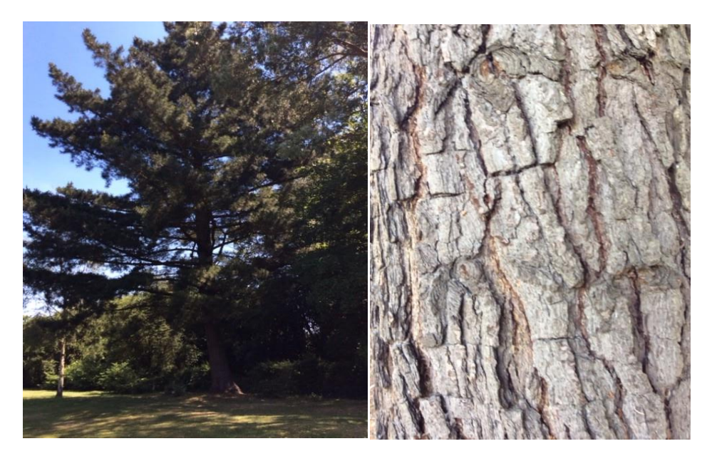
Fir Tree and its Bark (number 12 on the map).

If you turn around with your back to the fir tree you will see another pedestrian bridge ahead of you. Walk over the pedestrian bridge you will find yourself back on the green with a seat to your right and the pavilion building on the same path.