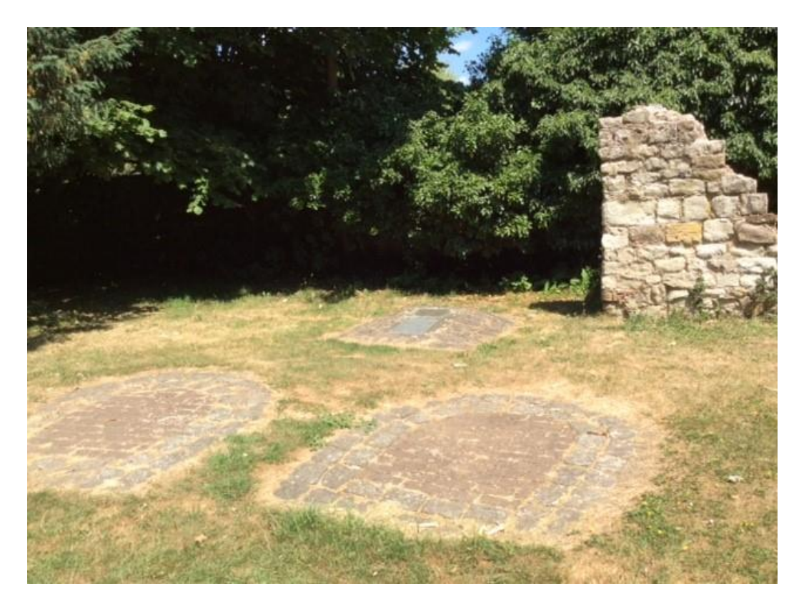
(number 6 on the map)

These low walls are all that remains of the out-buildings. Dormitories, kitchens the dining hall and the storerooms would have been located in this area. To your left are the remains of a bread oven. There would have also been toilets with running water, fed from the Abbey River, and an infirmary where sick monks and town's people would have been treated.