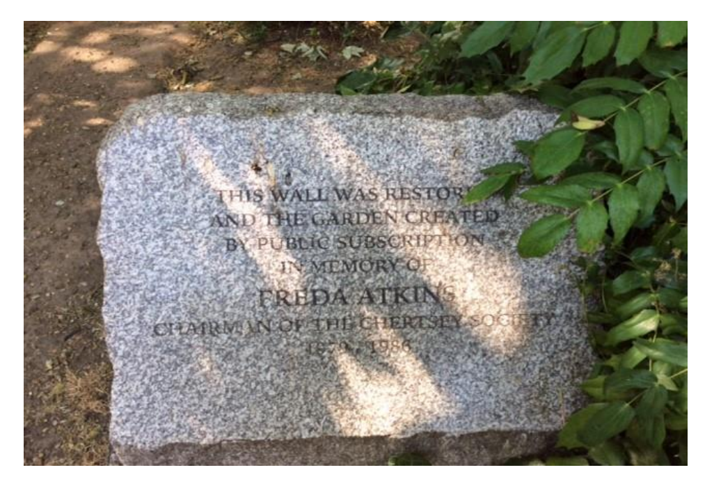
The inscription on the memorial stone reads:

Once past the walnut trees you will see a seat in the far corner, and on your left, a stone memorial and part of the former Chertsey Abbey wall ( number 4 on the map ).