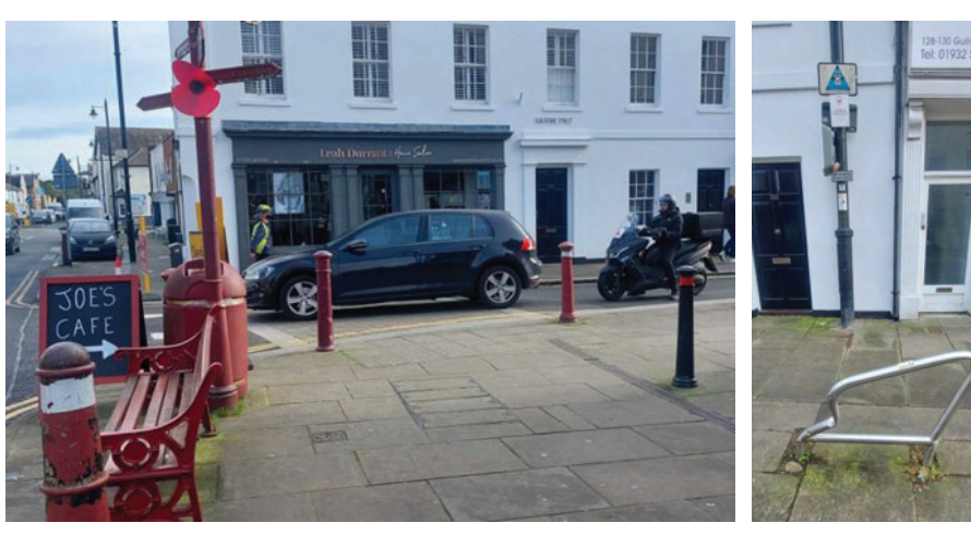
Photos illustrating the wide variety of styles and colours used for street furniture on Guildford Street, poor maintenance of existing features such as bike rack, and excessive signage attached to a historic lamp in the background. Addressing these types of issues would improve the character of the Conservation Area and wider street scene.