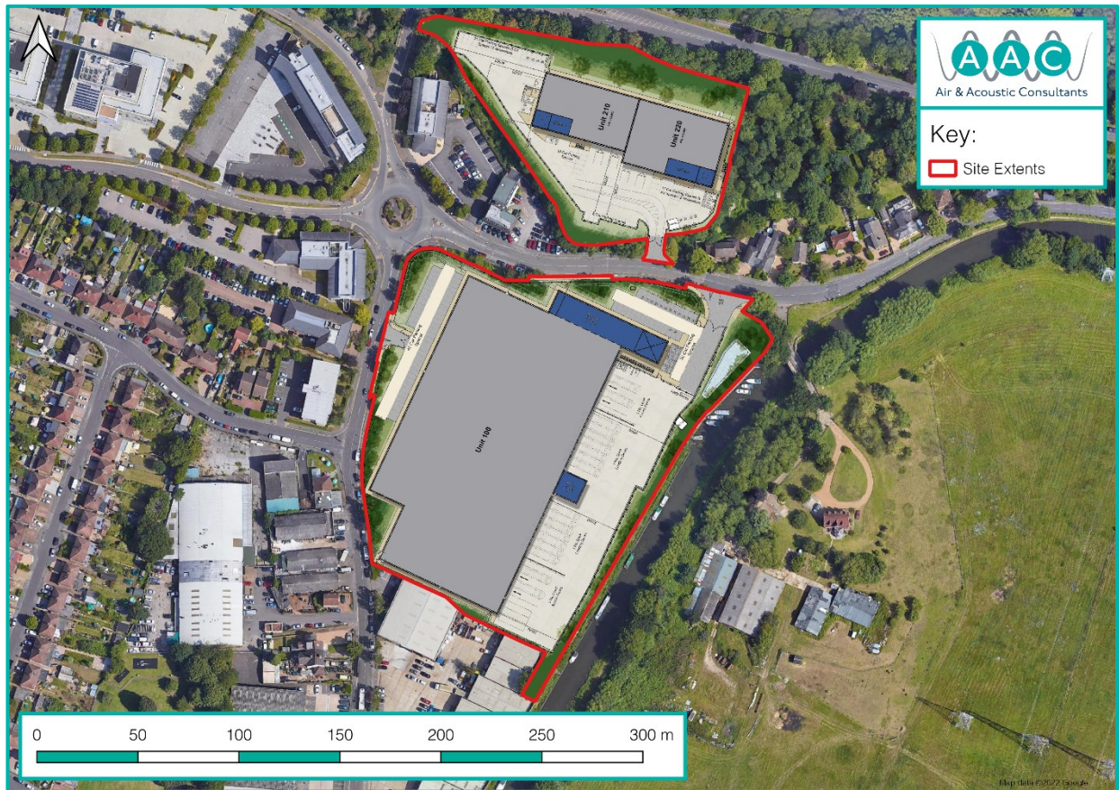
Figure 1: Proposed Site Layout