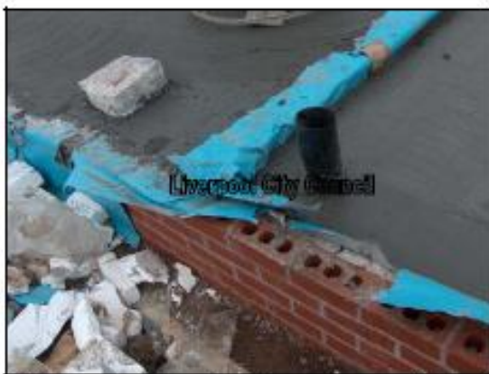
Jointing not sealed and membranes torn, as visible after casting of slab.