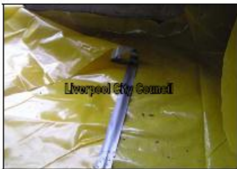
Duck tape failing to seal membranes rather than use of butyl tape and girth jointing strap.