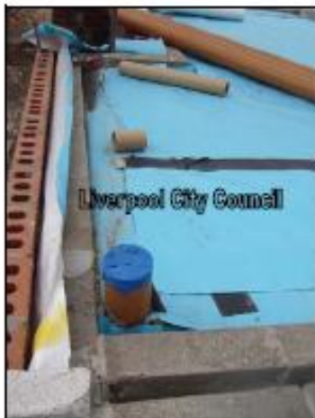
No tophats sealing service entry