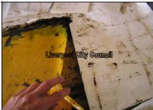
Gas membrane not sealed.