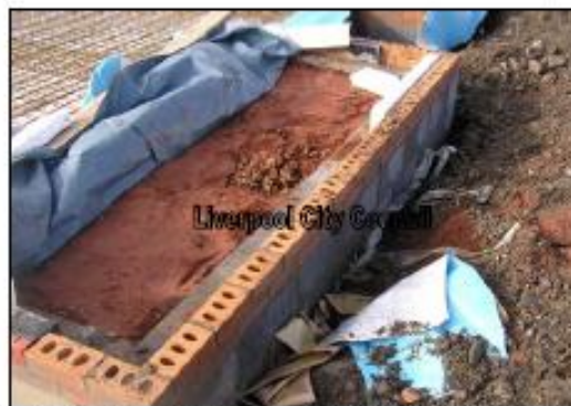
Use of non gas resistant DPM (blue backing colour) of same colour as gas resistant DPM (silver backing colour), with only gas resistant membrane used across cavity (to appear like gas resistant membranes after casting of slab. Sacrificial membrane absent with sand blinding filling granular void.