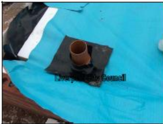
Tophat split over to fit service entry