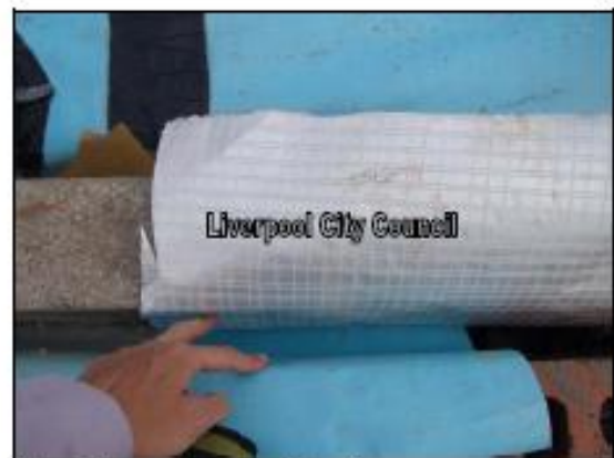
No seals present over wall cavity