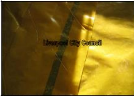
No girth jointing tape between sections of membrane (although butyl tape visible)