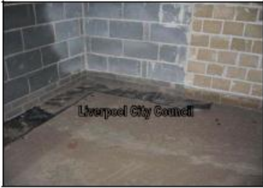
No DPC present under internal wall.

The following photographs are examples of membranes not correctly installed and potentially putting the future inhabitants of the properties at risk.