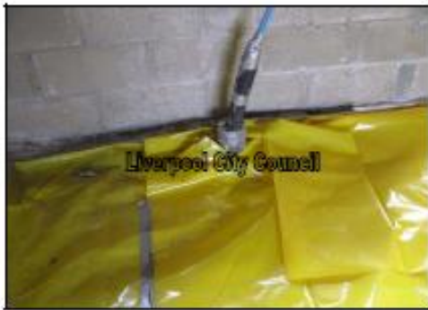
No tophat (formed or preformed) around service entry. "Duck Tape" used to seal overlaps of membrane. No butyl seal on joints. Membrane not sealed to tape.