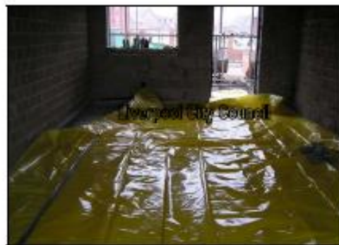
Membrane not sealed to gas resistant DPC.