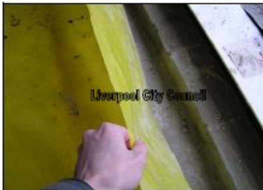
Gas membrane not sealed and no gas resistant DPC.