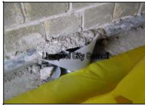
Top hat split, not sealed to service entry or membrane.