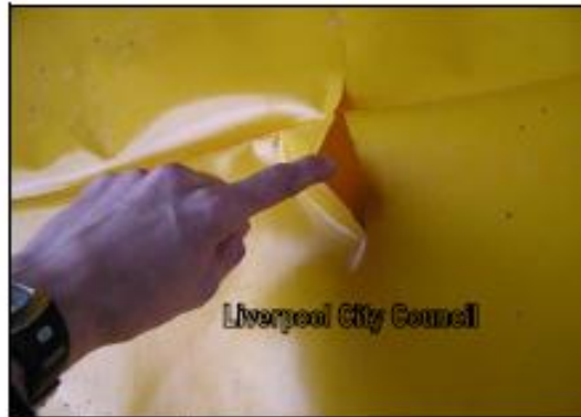
Tears in gas resistant membrane