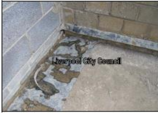
Use of non-gas resistant DPC (right of picture) compared to gas resistant DPC (left of picture)