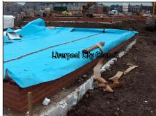
Butyl tape used span over seals of membrane rather than in between.