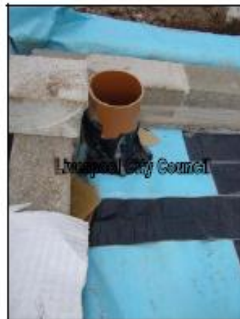
Use of standard butyl tape as a tophat

Re-produced and referenced with kind permission from the Liverpool City Council document.