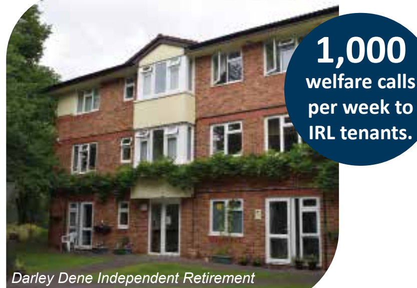
Living site in Addlestone

✓ Following consultation with independent retirement living tenants, we will carry out a four year, £1.7m investment plan.