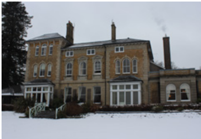
The Merlewood Care Centre in Virginia Water, like many buildings and structures on the Local List, has both historic and architectural interest