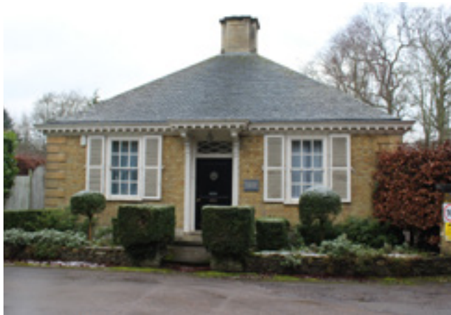
Woking Lodge is one example of a building included on the Local List, it is associated with the Ottershaw Park Estate

Architectural interest: an example of an architectural style, representative of a specific use, a technique of building, use of materials or use of ornamentation or decoration which is of artistic merit (e.g. sculpture)