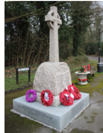
War memorials, such as this one in Thorpe, contribute to local identity and distinctiveness and have therefore been included on the Local List