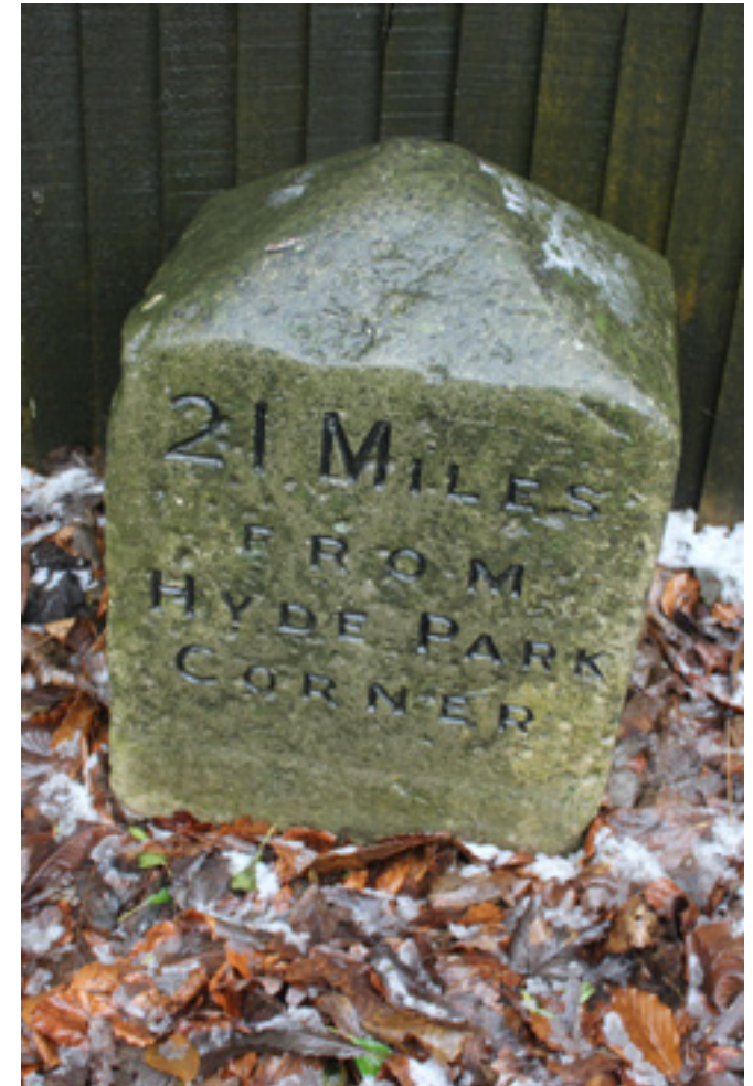
The Milepost near the Wheatsheaf Hotel in Virginia Water is included on the Local List for its historic interest