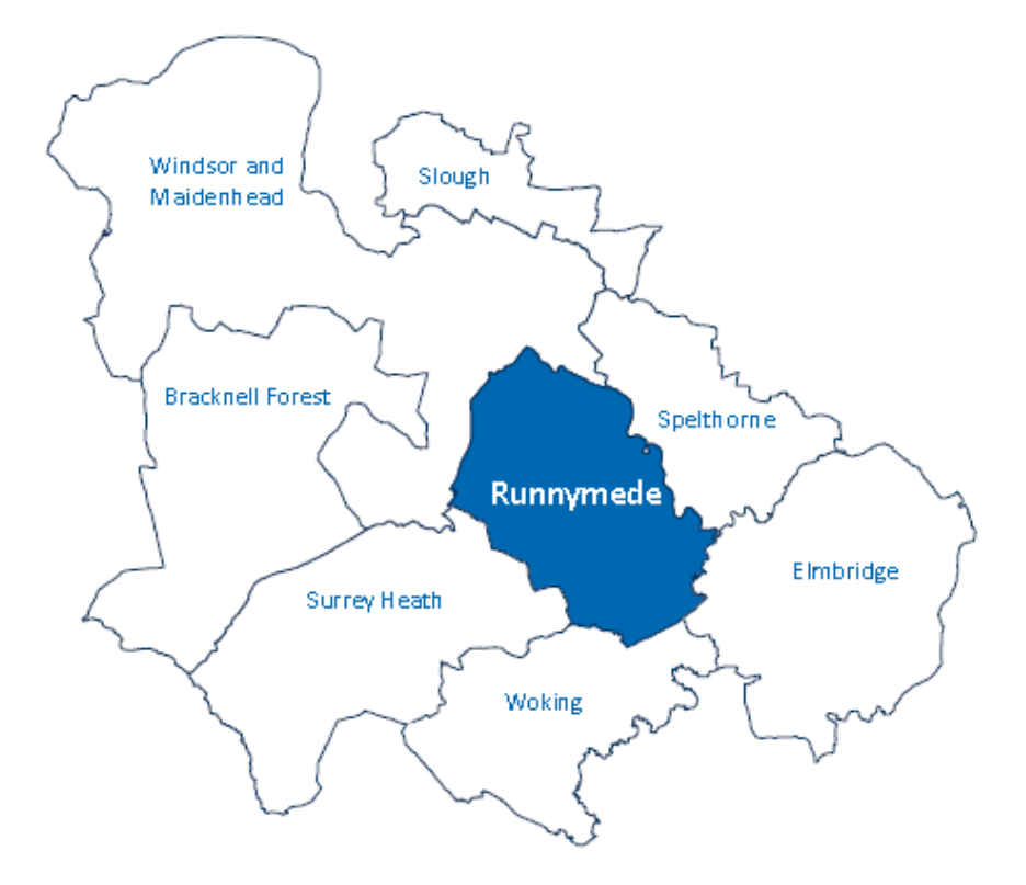
Figure 1 Runnymede and neighbouring Boroughs