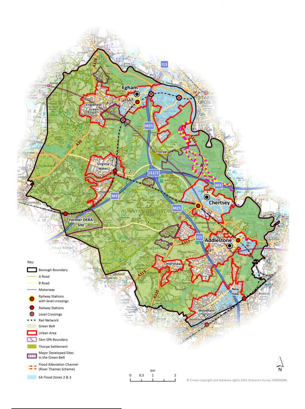
Figure 2 Runnymede Key Diagram

dominated by the service sector, which employs the majority of the workforce, while manufacturing accounts for just 2%<sup>1</sup>. Businesses and institutions in the Borough include: Ashford and St Peters Hospital Trust (ASHP), Royal Holloway (University of London), The Animal and Plant Health Agency, Thorpe Park, Procter and Gamble, British Gas, Gartner UK, Chep, and Tesco Stores <sup>2</sup>.