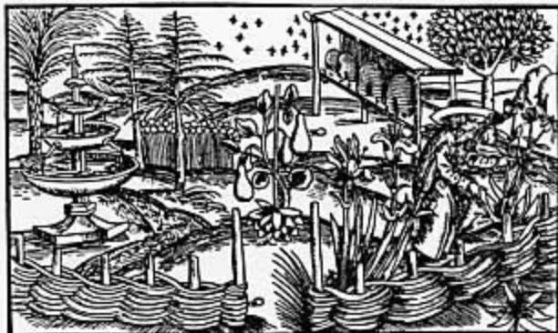
A MEDIEVAL GARDEN containing fruit trees, beehives and decorative plants

In the earlier centuries of the Benedictine order meat was only eaten on special occasions, when beef or pigs' meat (in the form of pork, bacon or pickled pork) would have provided a welcome variation to the diet. The day-to-day food eaten in the Abbey mainly consisted of dairy produce; cheese, milk, eggs, with bread from corn milled at the Abbey mills which stood downstream on the Abbey River. Vegetables would have included beans, onions and leeks. There would be honey from beehives kept among the fruit trees to aid pollination, and grapes from vineyards on St. Ann's Hill provided wine.