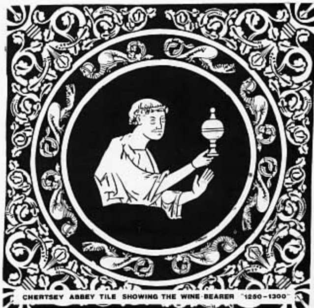
CHERTSEY ABBEY TILE SHOWING THE WINE-BEARER 1250-1300