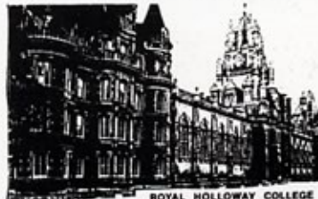
ROYAL HOLLOWAY COLLEGE