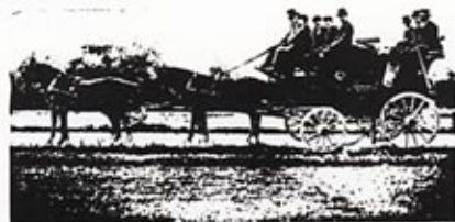
THE VENTURE COACH AT RUNNYMEDE

1965 The John F. Kennedy Memorial at Runnymede was unveiled by Her Majesty Queen Elizabeth II.