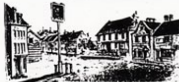
EGHAM HIGH STREET 1822