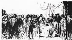
An 18th Century representation of the sealing of the Magna Carta