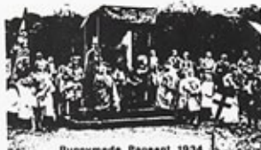
Runnymede Pageant 1934