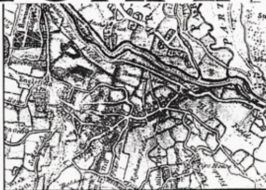
ROGQUE'S MAP OF EGHAM 1752