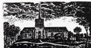
Egham Church in medieval times