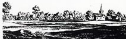
EGHAM IN THE 17th CENTURY