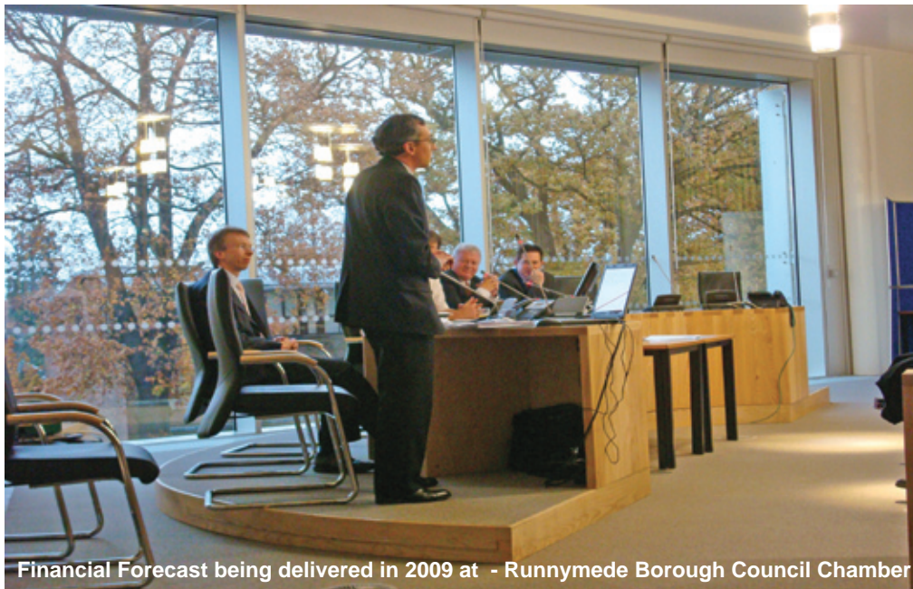
Financial Forecast being delivered in 2009 at - Runnymede Borough Council Chamber

Useful websites for businesses : www.voa.gov.uk/2010 www.businesslink.gov.uk